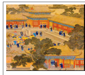
10,000 Nations Coming to Pay Tribute (detail). Collection of The Palace Museum, Beijing.

The tour of the Forbidden City exhibit at the Phoenix Art Museum will be in place of our regular meeting for February 21 st . This is just a social time, no meeting.