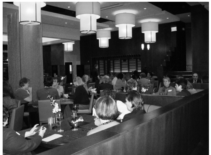
HALL members enjoy the HALLiday luncheon at the very trendy Vin.