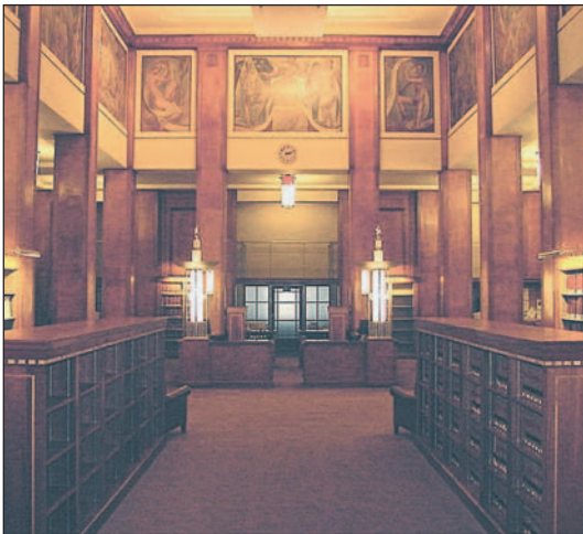
Photo of the Library Reference Desk at Main Library

Today, the Justice Libraries have grown to multiple locations and over 300,000 volumes. The Libraries now encompass resources available via the Internet and a variety of electronic databases, while maintaining a rich and historical print collection.