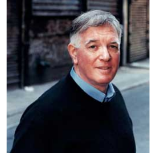
Philip Margolin 2008 SCCLL VIP

His latest novel, Executive Privilege , goes on sale this month. Many of his novels are set in Portland, so they are great reads in preparation for the Annual Meeting this year. You will learn a lot about the city and its culture from Margolin's writing, and you'll enjoy his gift for story and character development along the way.