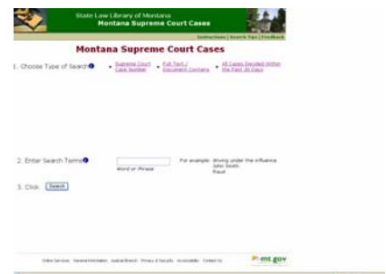
Screenshot of the search page on the Montana State Law Library website.

(Montana State Law Library continued on page 32)