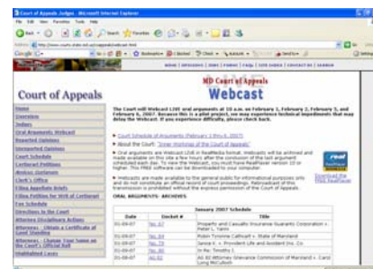
Screenshot of webcast page on Maryland State Law Library website.

Web cast arguments from Maryland's highest court are currently being archived on the Maryland Judiciary web site at http://www.courts.state.md.us/coappeals/webcast.html . ■