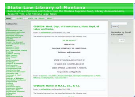
Screenshot of the Newsfeed page on the Montana State Law Library website.

At the end of each week, we are adding a post titled, "Recent Briefs," which collects links to all of the current briefs added to the database in the past week. This will allow our patrons to keep track of their own cases, and to see what other new cases have been filed in the Supreme Court.