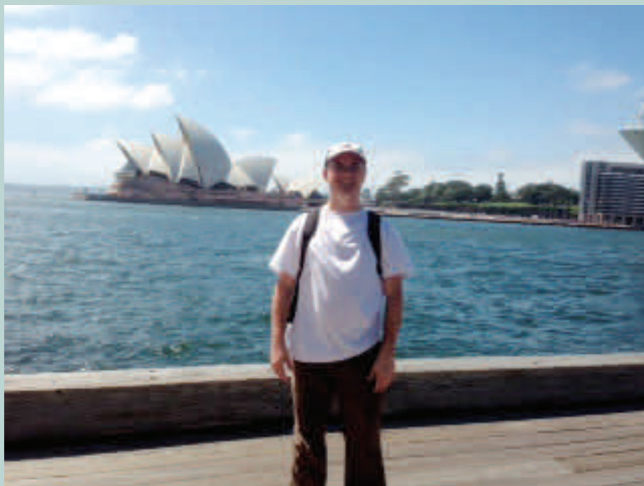
Sydney Opera House, After Being Up For 30 Hours

Obviously, I can't write about an excursion half way around the world without talking about the location itself. I knew