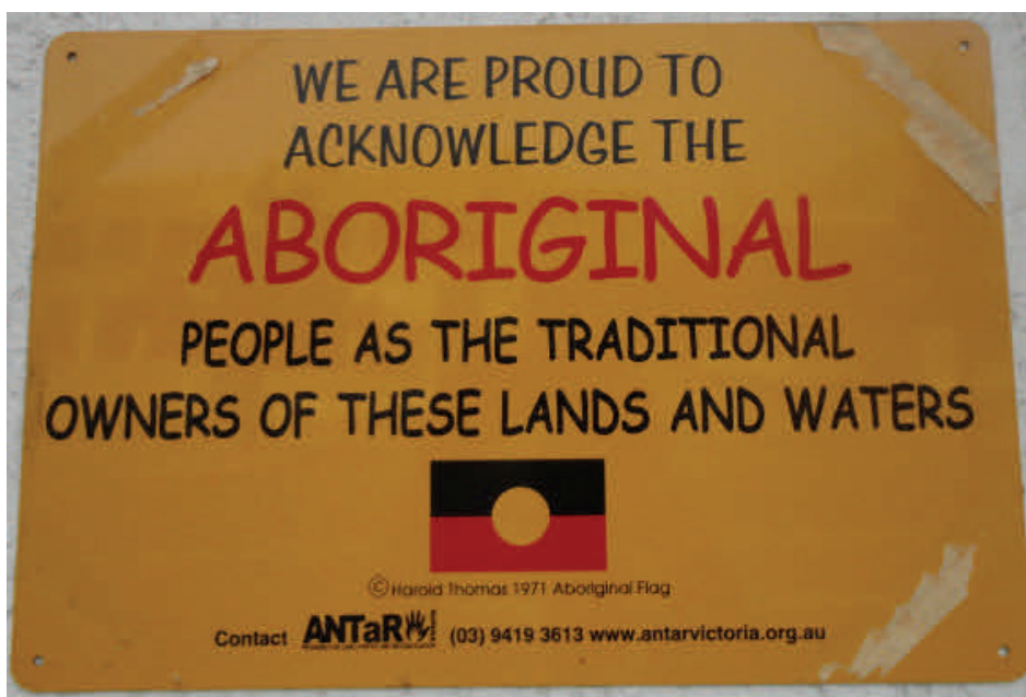
Acknowledgement of Country Sign, Seen Outside a Coffee Shop

Aside from the interesting topics discussed during the programs, there were a number of well-organized social events including a tour and reception of the Supreme Court of Victoria library and a lovely dinner at the