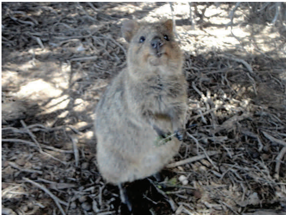
A Quokka, Which Lives Almost Exclusively on Rottnest Island

8 See https://jade.barnet.com.au/Jade.html .