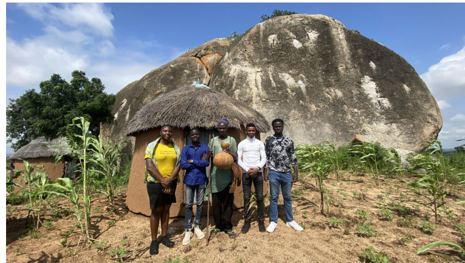
Free Knowledge Africa Team at a cultural heritage site in Gunning Village, Pilgani, Langtang North, Plateau State