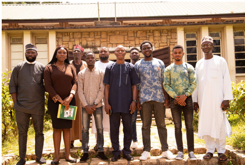
Free Knowledge Africa Team at the National Museum Jos