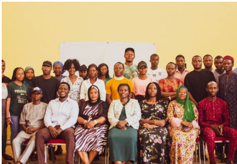
2023 Public Domain Day Celebration at the National Library of Nigeria, Kwara State Branch