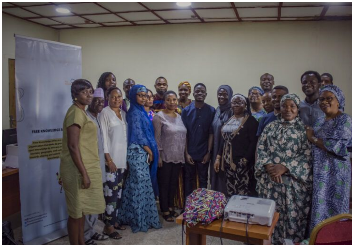
Open Sharing and the 21st Century Librarian training at the National Library of Nigeria headquarters, Nigeria