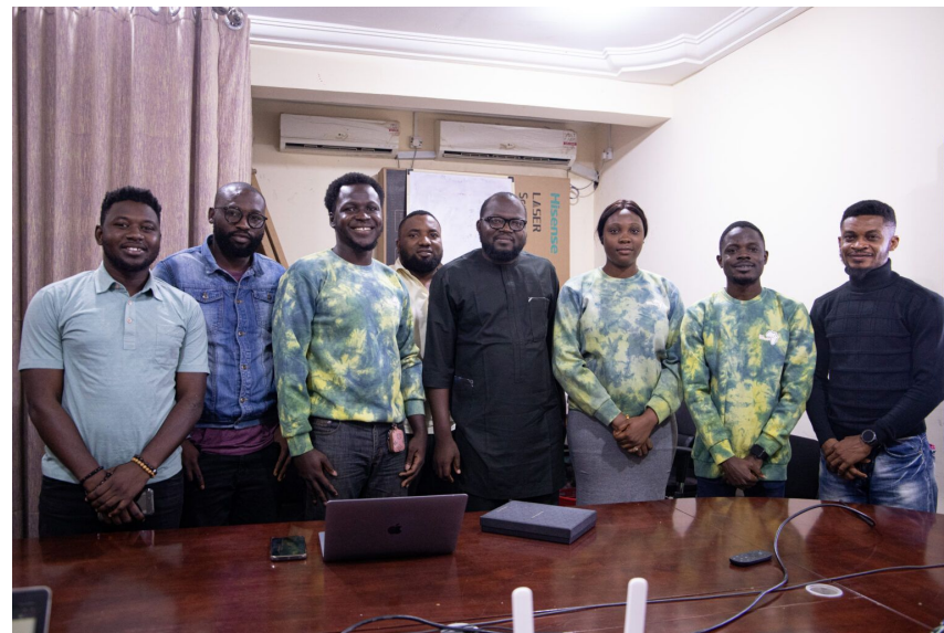
Free Knowledge Africa Team at the Plateau State ICT Development Agency