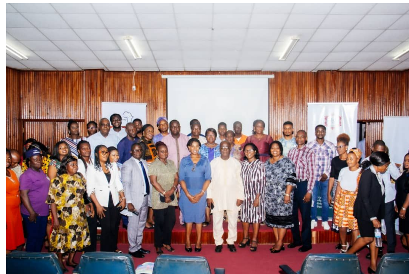
2024 Public Domain Day Celebration in collaboration with National Institute of Advanced Legal Studies and Nigerian Copyright Commission