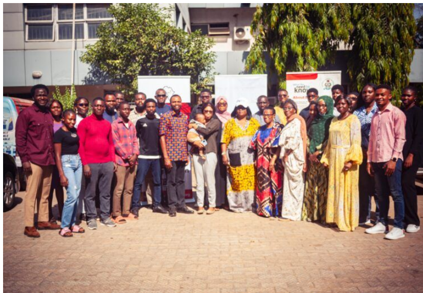
Public Domain and Historical Knowledge Training at the National Library of Nigeria, FCT Branch