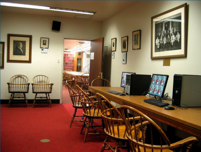
Hon. Harry A. Cole Self-Help Access and Information Center

The ribbon cutting for the Hon. Harry A. Cole Help Access and Information Center in the Baltimore Bar Library in Baltimore City was held on December 9, 2025. (See the press release .) The Baltimore Bar Library is a membership library but has worked with the Baltimore City Circuit Court to create a space for self-represented litigants with access to a range of resources, including the ability to chat online with Maryland Court Help Center attorneys from the center's computer workstations. Users of the Center have access to all law library resources.